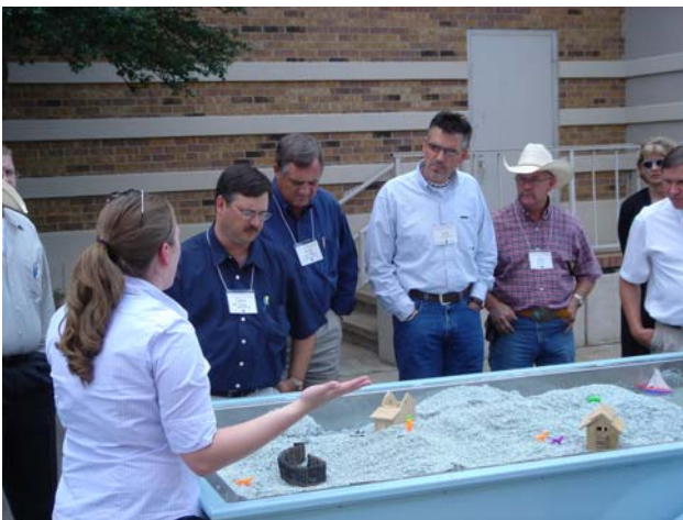
TCE Personnel exhibiting the capabilities and teaching potential of the demonstration trailer to NRCS and TCE personnel at the Watershed Management Training