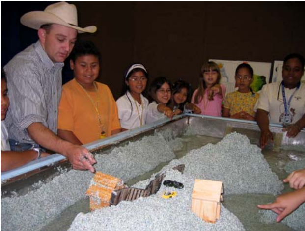
Demonstration Stream Trailer being used for a presentation to 5 th grade students