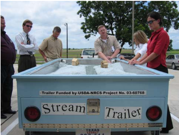
TCE Personnel exhibiting the capabilities and teaching potential of the demonstration trailer to project participants